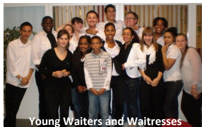
Young Waiters and Waitresses

During the weekend of the 12 November, the European pastors and leaders and their wives met in Rotterdam. People began arriving on Thursday and on Friday night everyone got together for dinner. This was prepared and served by the young people of Rotterdam. They did a great job! The pastors meeting was held on Saturday where a number of issues were discussed, mainly relating to revival and how to achieve more of it.