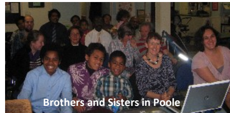
Brothers and Sisters in Poole

We've also been practicing our item for camp and we are looking forward to it. See you there.