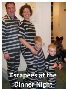
Escapees at the Dinner Night