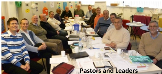
Pastors and Leaders