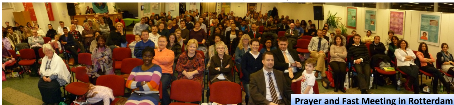
Prayer and Fast Meeting in Rotterdam

Then we had a prayer and fast. In the talks we were reminded that it is necessary to receive from the Lord and to give it to others. That we shouldn't be slack with our salvation, which is the most precious thing in our life. We had a presentation over prophecies in the Bible. Great to see that God is in control to see His plan through.