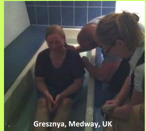
Gresznya, Medway, UK