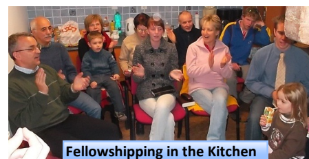
Fellowshipping in the Kitchen

Another warming highlight was our improvised, vibrant meeting in the kitchen of the hall, due to the main heaters breaking down!