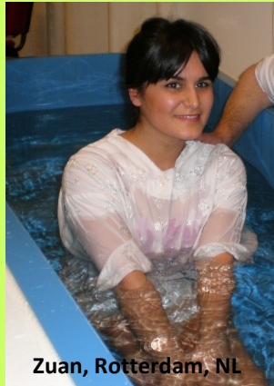
Zuan, Rotterdam, NL