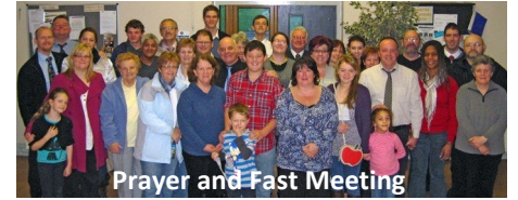
Prayer and Fast Meeting

Almere for the first time. A fantastic weekend. We also had another very enjoyable combined Prayer and Fast in Manchester with the Yorkshire brethren. The theme was, " If we live in the Spirit, let us also walk in the Spirit. " Galatians 5:25. It was very encouraging to hear the Word from our brothers, particularly the youngsters. Good to see some young men "stepping up to the plate." There was much rejoicing when we