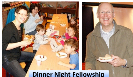
Dinner Night Fellowship