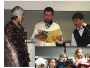
Performing Fawly Towers at camp

We had a number of visitors during the month and we are praying that they will do the right thing and will be baptized and pray for the Holy Spirit.