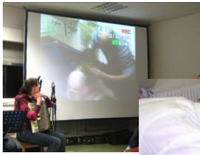
Baptism in Dordrecht