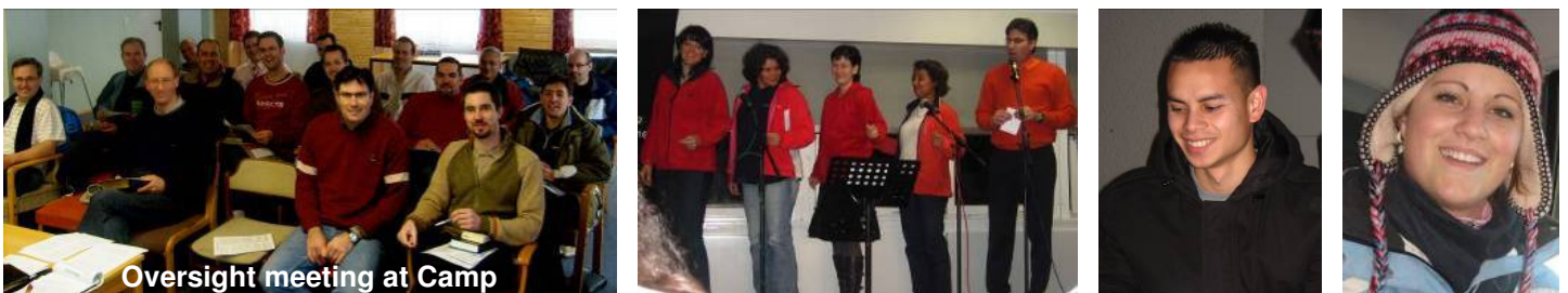
Oversight meeting at Camp