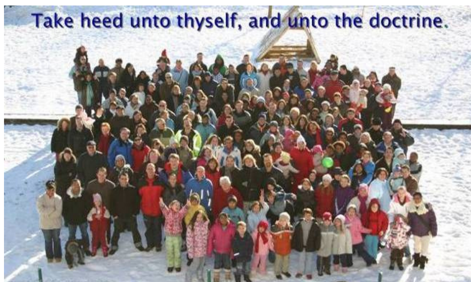
Group photo, Winter Camp 2008, Germany