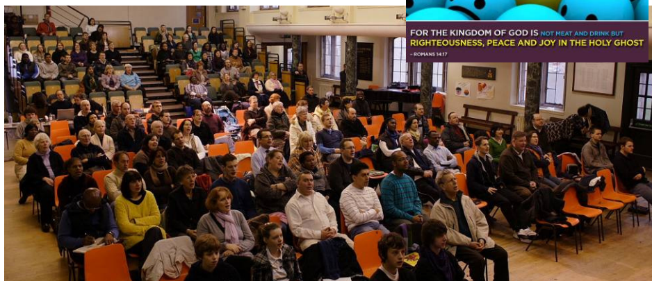
Meeting, Winter Camp 2008, UK

FOR THE KINGDOM OF GOD IS NOT MEAT AND DRINK BUT RIGHTEOUSNESS, PEACE AND JOY IN THE HOLY GHOST - ROMANS 14:17