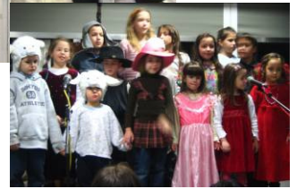
Children's item at camp